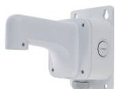
Wall Mount SN-CBK502