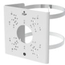
SN-CBK627D Pole Mount