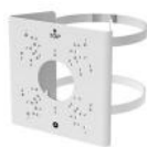
SN-CBK627D Pole Mount