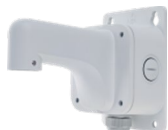
Wall Mount SN-CBK502