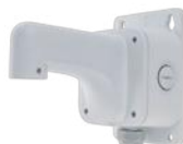
Wall Mount SN-CBK502